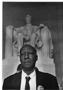
A. Philip Randolph