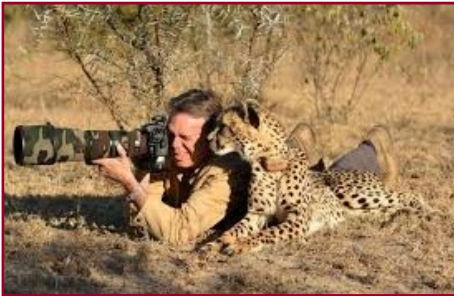
“What cha doing?”