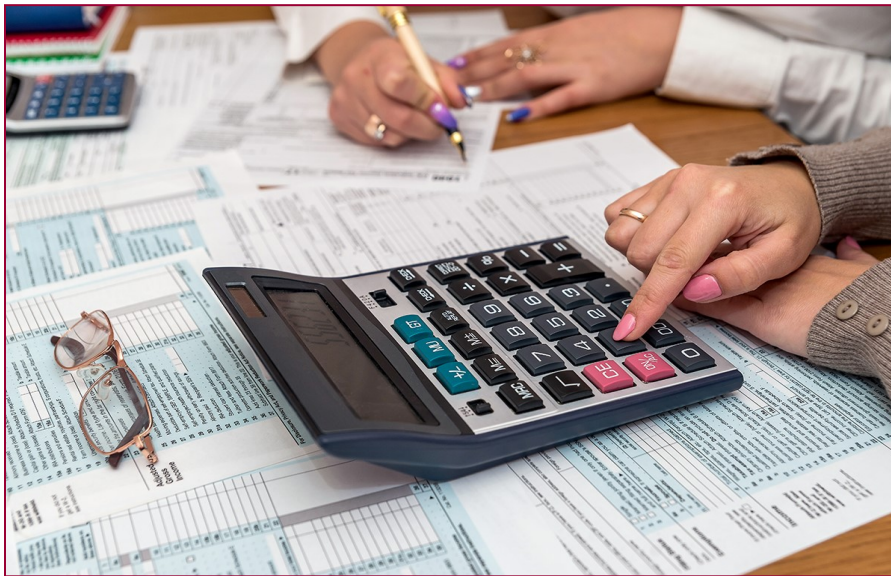
2018 state tax returns