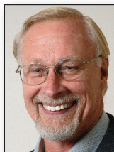
Associate/Deputy Chief Negotiator