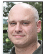
Assistant Chief Negotiator